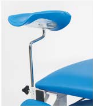
Adjustable Leg Holders